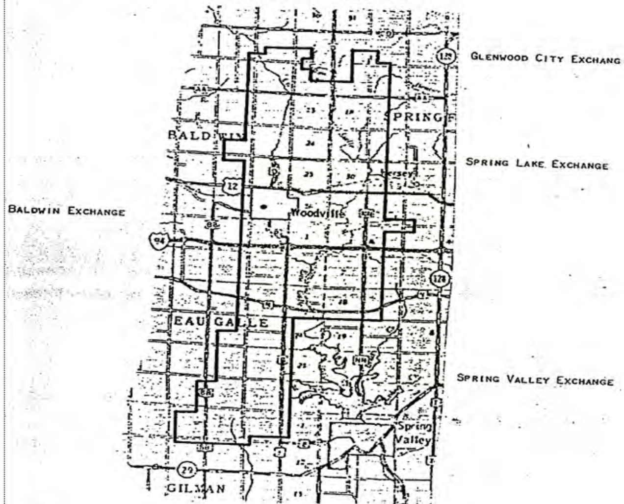
EXCHANGE AREA BOUNDARY MAP