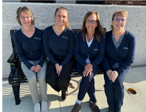
BALDWIN LIGHTSTREAM MOMS

This Mother's Day, we celebrate mothers of all kinds — the ones who raised us, guide us, support us, and show up in countless ways every day. Whether it's a mom, stepmom, grandmother, mentor, or someone who simply stepped into that role when it mattered most, their impact reaches far beyond what words can express. As we honor the women who nurture, encourage, and hold families together, we're reminded how meaningful it is to stay connected — through a phone call, a video chat, or a simple message of appreciation. However you celebrate, we hope this day is filled with gratitude, love, and time spent staying in touch with the ones who mean the most.